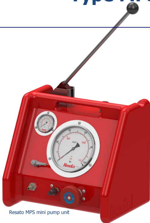
Resato MPS mini pump unit

Resato's new lightweight mini pump unit is available in four pressure ranges up to 1800 bar at 7 bar air drive pressure and 2500 bar at 10 bar air drive pressure.